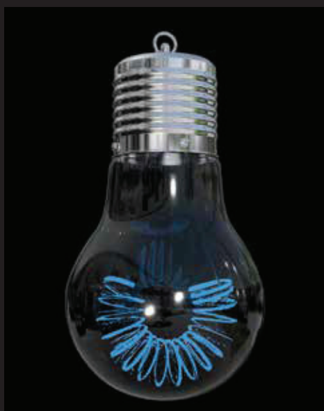
① Edison XL RGB DMX